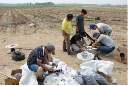
Sinofert donated and installed waterfertilizer-integrated drip irrigation system