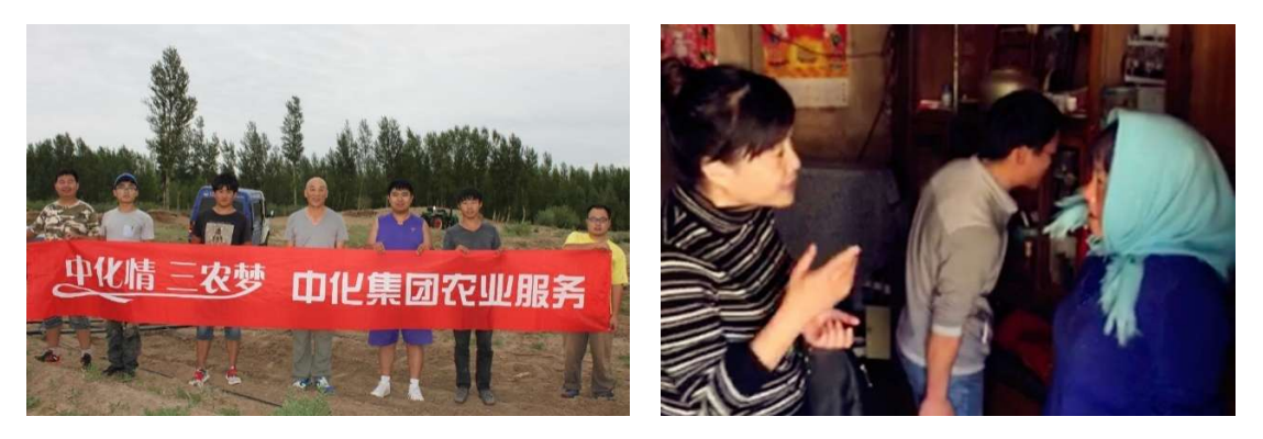
"Sinochem Dedicating to Rural Prosperity" provides on-site field training and tests for farmers